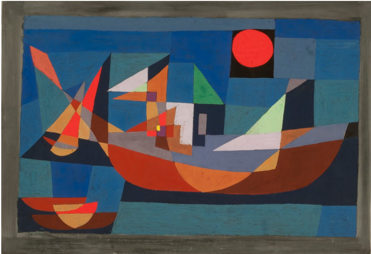
Paul Klee - Ruehende Schiffe (1927)

We hope you enjoy this last EMODnet News Digest of the year 2020. EMODnet wishes you all peaceful and relaxing days. Enjoy the break and recharge your batteries. Let's keep the spirit up and look forward to a year full of open data in 2021!